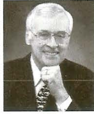
Former Governor Gerald L. Baliles